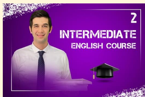
Intermediate English course