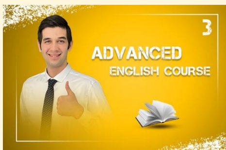
Advanced English course

Main features of my online English courses: