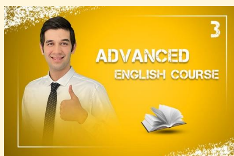
Advanced English course

Main features of my online English courses: