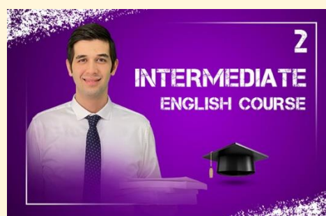
Intermediate English course