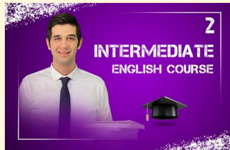
Intermediate English course