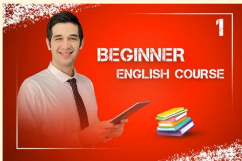
Beginner English course

Click on any of the courses to find out more!