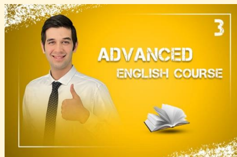
Advanced English course

Main features of my online English courses: